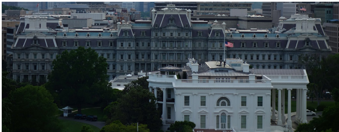
The Eisenhower Executive Office Building houses the National Security Council. Its close proximity to the White House enables presidential coordination of foreign and defense policies carried out by the departments and agencies. The national security advisor has an office in the West Wing of the White House. (Nicholas Suzor)