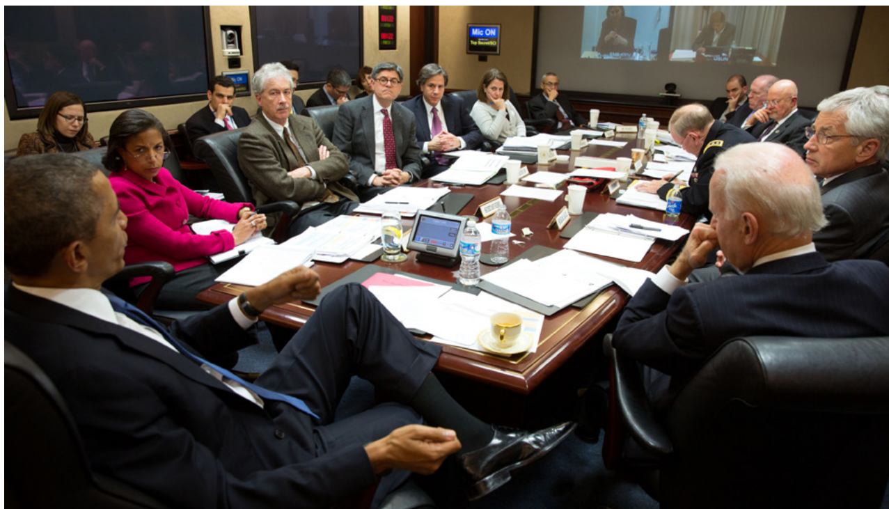
President Barack Obama convenes a National Security Council meeting in the Situation Room of the White House to discuss the situation in Ukraine, on March 3, 2014.